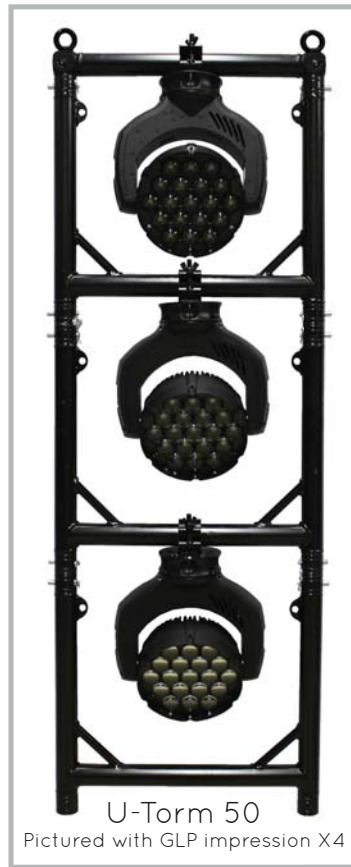
U-Torm 50 Pictured with GLP Impression X4

The U-Torm is available in two standard sizes, but can be built upon and customized using the standard Cosmic Truss F31 range of 2" pipes, T-sections, spigots, and corner adapters. These all fit seamlessly into the U-Torm allowing you to create hanging positions or structures in an unlimited variety of combinations.