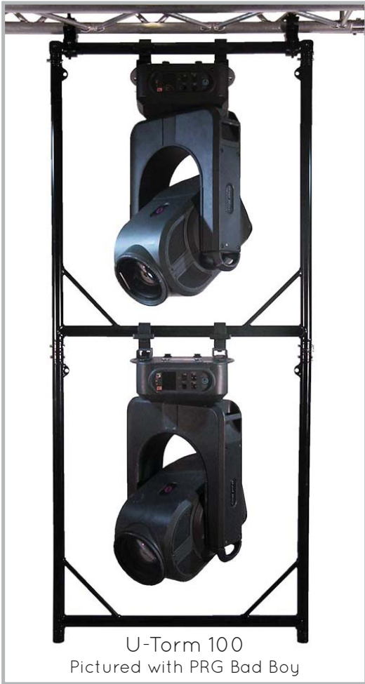
U-Torm 100 Pictured with PRG Bad Boy

Comprised of lightweight modules and sections, the U-Torm allows endless configurations for single fixtures, double hangs or ladders of multiple fixtures, which can also be expanded to create a wall of hanging positions.