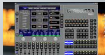
CREATION II - ONPC