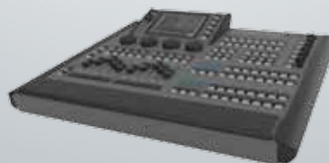
CREATION II - 1024