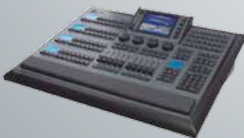
CREATION II - 4096